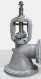
Forged angle globe valve