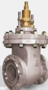
Parallel slide gate valve