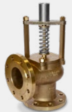
Safety globe valve