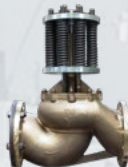
Safety globe valve