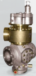
Equipped ball valve